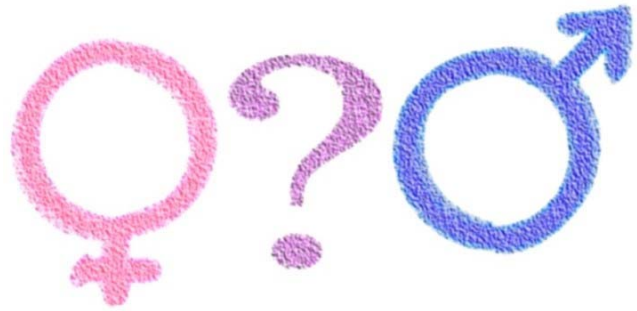
A question of identity

But what about our souls, the very persons we really are? We can become happier by changing our looks for the better and thus enter a new role, but inside we are still the same persons as before. So what is happening then?